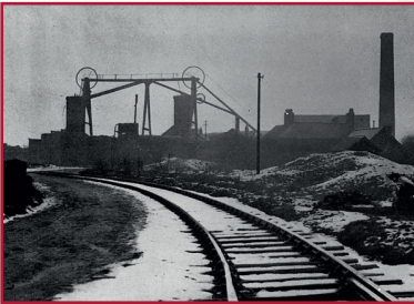
Lawrence described the coal mines:

The twin headstocks and nearby disused mineral railway track are all that remains of an extensive coal mining enterprise owned by Barber, Walker & Co.